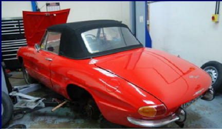
Alfa Romeo Duetto service