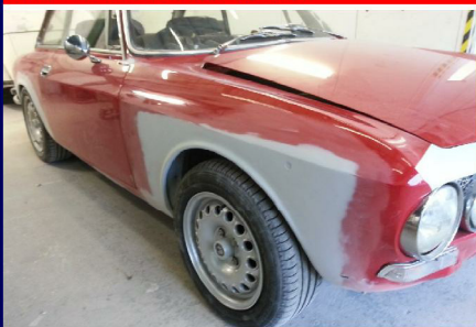
Alfa Romeo Coupe wheel arch repairs