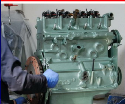
Austin Healey engine rebuild