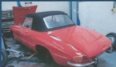
Alfa Romeo Duetto service

Our modern and fully equipped workshop in Strensham is handily located adjacent to the M5 and the M50.