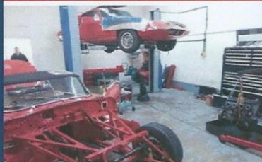
E-Type and Lotus rebuilds

RetroMarques also runs a specialist bodywork and paintshop facility - Tony Williams Bodyshop - in nearby Malvern. Here all aspects of bodywork repairs and paintwork are carried out from the repair of small scratches to a full bare-metal respray and anti-corrosion protection.