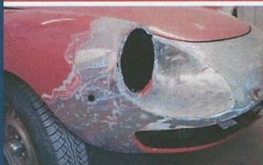
Alfa Romeo Spider front end work

Some specialist aspects of classic car restoration are better left to independent experts and over the years we have developed a well established network of local specialists and trade suppliers. Chroming, carburettor rebuilding, gearbox and overdrive overhauls, blasting and powder-coating, instrument refurbishment, brake cylinder and servo rebuilding, trim and upholstery and machine-shop specialists are all on hand.