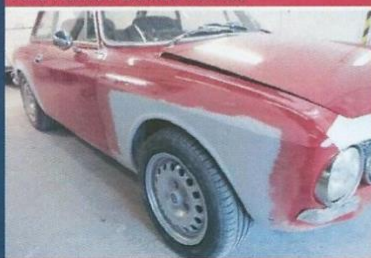
Alfa Romeo Coupe wheel arch repairs

Our modern and fully equipped workshop in Strensham is handily located adjacent to the M5 and the M50.