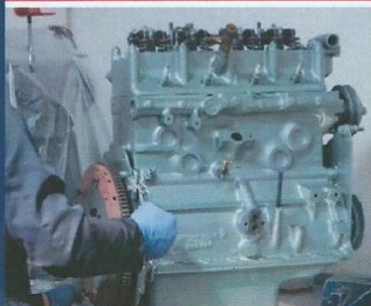
Austin Healey engine rebuild

Tony Williams Bodyshop. Unit 2 Chase Works, Spring Lane South, Malvern, Worcestershire, WR14 1AT