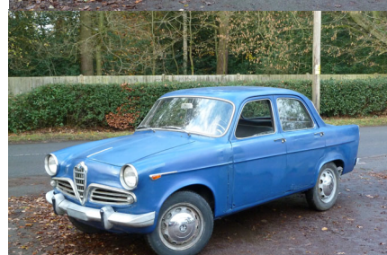
Giulietta Ti and MV Agusta 750 F4 Serie