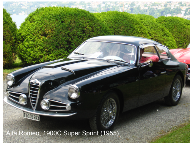
Alfa Romeo, 1900C Super Sprint (1955)