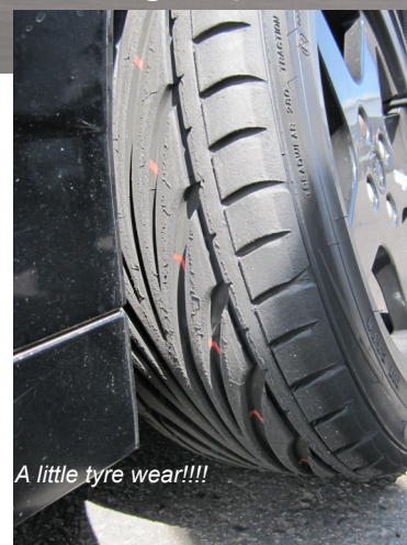
A little tyre wear!!!!