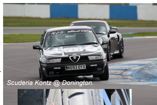
Scuderia Kontz @ Donington.