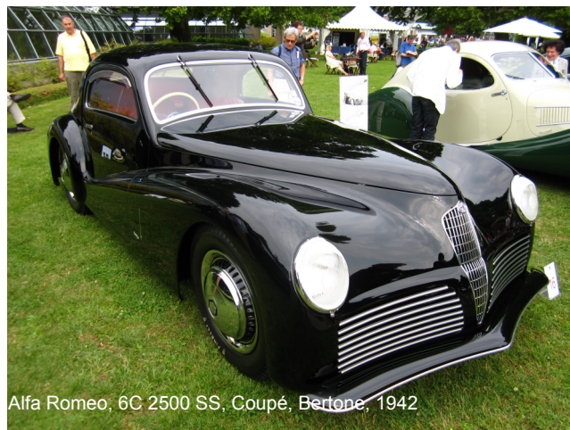
Alfa Romeo, 6C 2500 SS, Coupé, Bertone, 1942