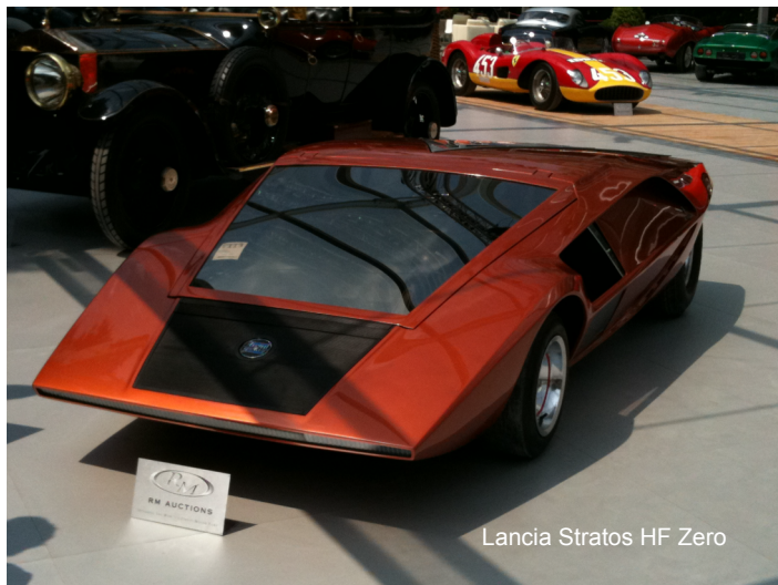
Lancia Stratos HF Zero