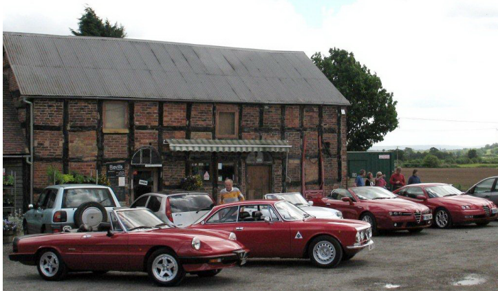
Alfas gathered at Revills farm shop