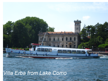
Villa Erba from Lake Como

A leisurely morning around Lake Como and lunch at a local pizzeria in the hills above Cernobbio rounded off a brilliant weekend and a show well worth the effort to attend.