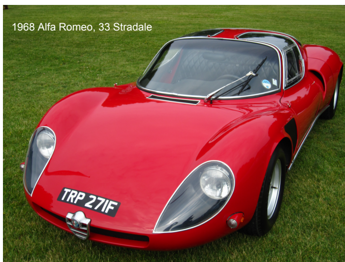
1968 Alfa Romeo, 33 Stradale