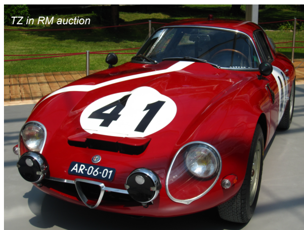
TZ in RM auction