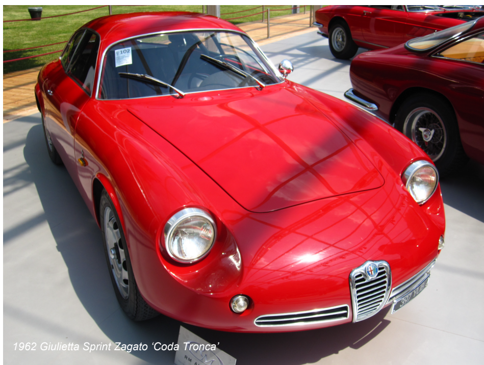
1962 Giulietta Sprint Zagato 'Coda Tronca'