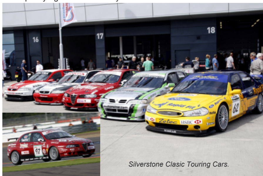
Silverstone Classic Touring Cars.

As always there was a host of other must see races and cars including a rather crumpled Bertie which looked very sorry for itself after qualifying on a wet Friday