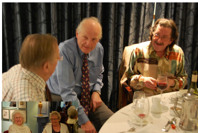
Three wise men !?