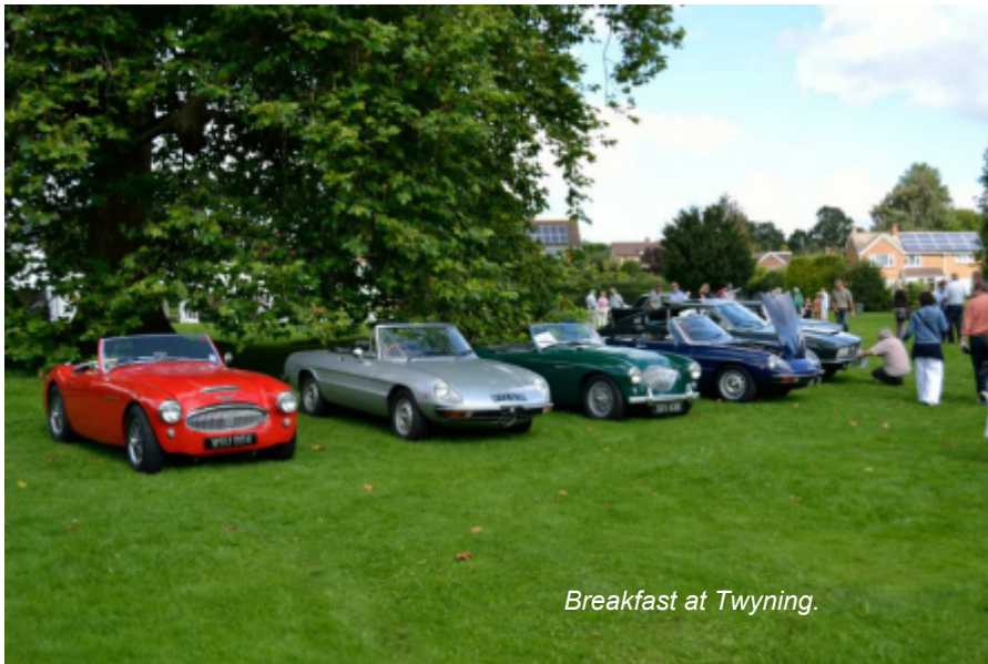
Breakfast at Twyning.

If you do not fancy the visit to Croome Park and the walk but would like to come along to Twyning for the start then no problem but please let me know so we can plan numbers for the bacon rolls. - MB