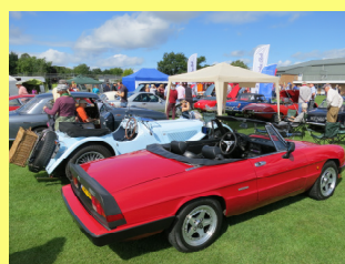
Below: The Spider looked great in the sunshine