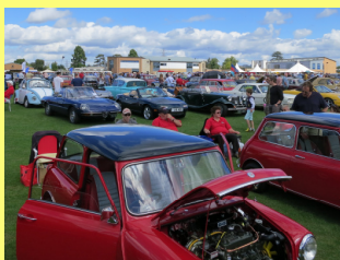
Above: There were plenty of Mini's on show

I can recommend this show for next year and perhaps it is time to include this as a section event and get a real show of Alfas there? Entry is free for exhibitors; with a £5 fee each for any passengers. MG