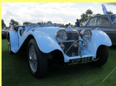
Above: Suffolk SS100 Jaguar

Sunday 18th August, Tewkesbury Classic Car Festival started with an early coffee and bacon roll at the Railway Inn at Ripple and then the 'Friends of RetroMarques' contingent convoyed to the event, held at Tewkesbury School, in the warm morning sunshine. RetroMarques took a plot at the show and invited friends and customers to join them with their cars, a great mix of cars and people.