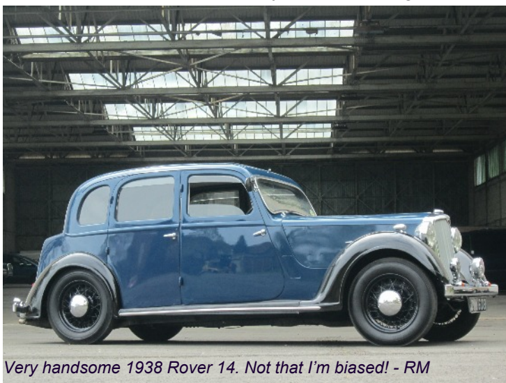
Very handsome 1938 Rover 14. Not that I'm biased! - RM

The next 'Scramble' clashes with CAD 2015 so go to CAD but be sure to put the 'Scramble' on your list of things to do in 2016.