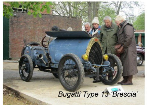
Bugatti Type 13 'Brescia'

This year we will be limited to 100 Alfas. Full details and entry forms are available on the Section website. Tickets are moving fast so please do get your applications in as soon as possible. - MB